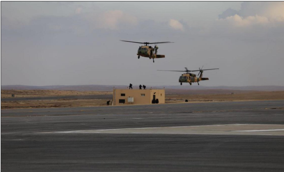
Figure 6. Blackhawk Helicopters arriving in Jordan January 2018

U.S.-Jordanian military cooperation is a key component in bilateral relations. U.S. military assistance is primarily directed toward enabling the Jordanian military to procure and maintain conventional weapons systems. 37 The United States and Jordan have jointly developed a five-year procurement plan for the Jordanian Armed Forces in order to prioritize Jordan's needs and procurement budget using congressionally-appropriated Foreign Military Financing (FMF). Proposed arms sales notified to Congress include 35 Meter Coastal Patrol Boats; M31 Unitary Guided Multiple Launch Rocket Systems (GMLRS) Rocket Pods; UH-60M VIP Blackhawk helicopter; and repair and return of F-16 engines. 38 On February 18, 2016, President Obama signed the United States-Jordan Defense Cooperation Act of 2015 (P.L. 114-123), which authorizes expedited review and an increased value threshold for proposed arms sales to Jordan for a period of three years. In January 2018, the United States delivered two S-70 Blackhawk helicopters to Jordan, bringing their total Blackhawk fleet up to 28 aircraft.