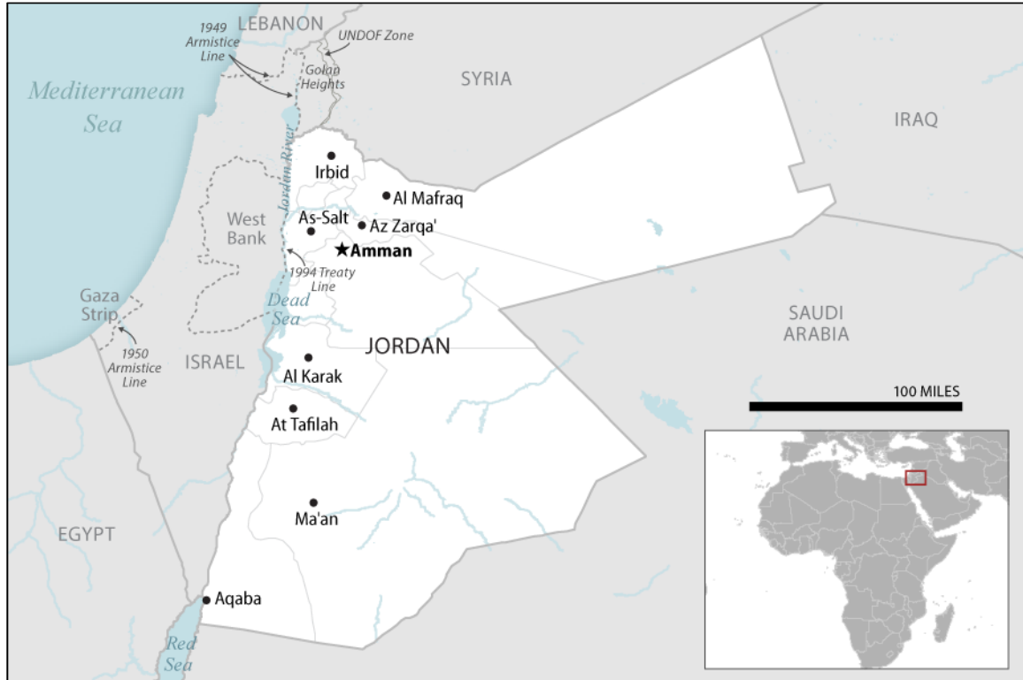
Figure I. Jordan at a Glance

Area: 89,213 sq. km. (34,445 sq. mi., slightly smaller than Indiana) Population: 8,185,384 (2016); Amman (capital): 1.155 million (2015) Ethnic Groups: Arabs 98%; Circassians 1%; Armenians 1% Religion: Sunni Muslim 97.2%; Christian 2% Percent of Population Under Age 25: 55% (2016) Literacy: 95.4% (2015) Youth Unemployment: 29.3% (2012)