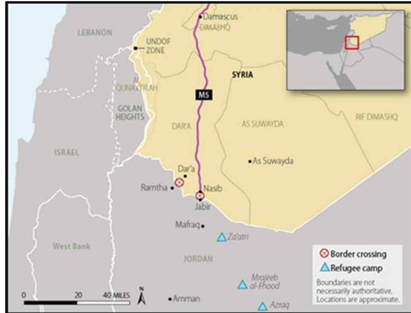
Figure 2. Syria-Jordan Border

According to USAID, the population at the unofficial camp near the berm at Al Rukban includes large numbers of extremely vulnerable people—more than half are children. In January 2018, the United Nations expressed appreciation to Jordan for allowing UN agencies to provide an exceptional delivery of humanitarian aid.