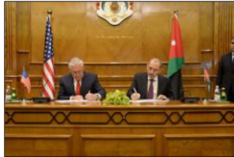
Figure 5. New U.S.-Jordanian MOU Amman, Jordan

According to the U.S. State Department, the United States is the single largest donor of assistance to Jordan, and the new MOU commits the United States to provide a minimum of $750 million of Economic Support Funds (ESF) and $350 million of Foreign Military Financing (FMF) to Jordan between FY2018 and FY2022. 31 In line with the new MOU, for FY2019 President Trump is requesting $1.271 billion for Jordan, including $910.8 million in ESF, $350 million in FMF, and $3.8 million in International Military Education and Training (IMET).